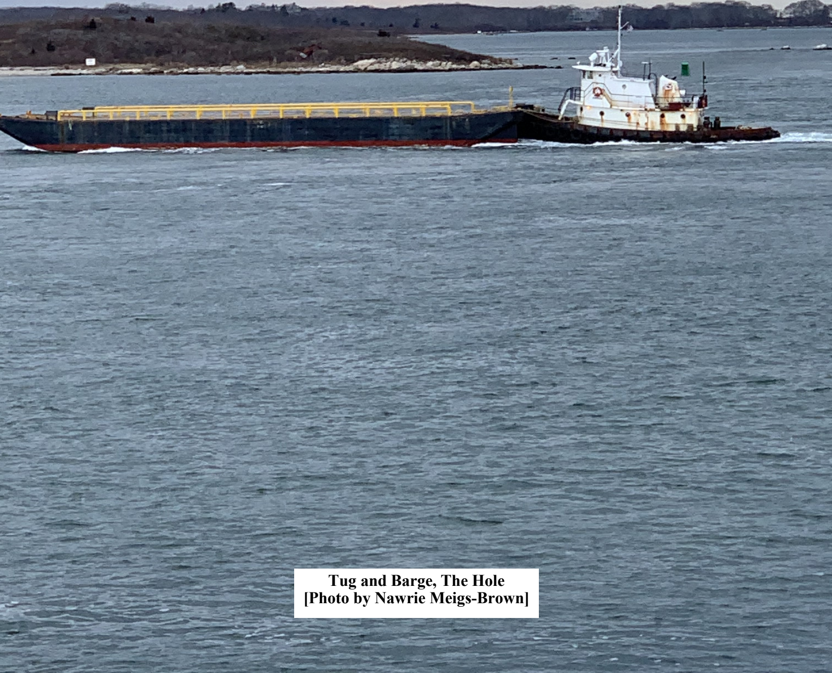
Tug and Barge, The Hole