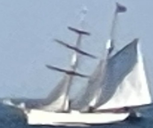
Schooner, Buzzards Bay