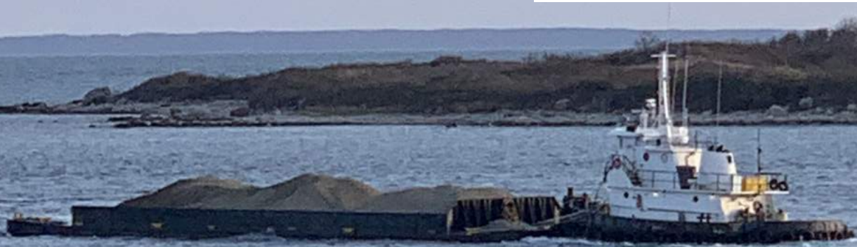
Barge, Woods Hole Passage