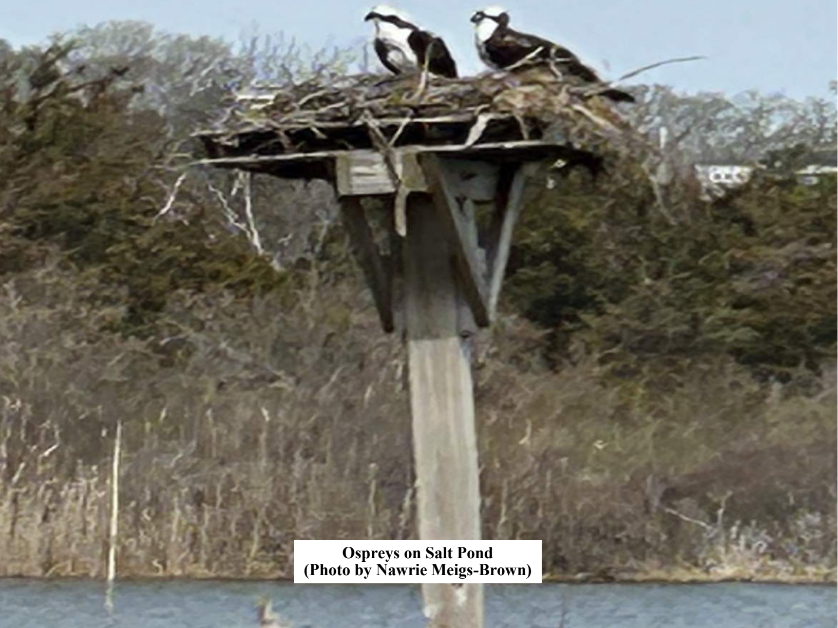
Ospreys on Salt Pond