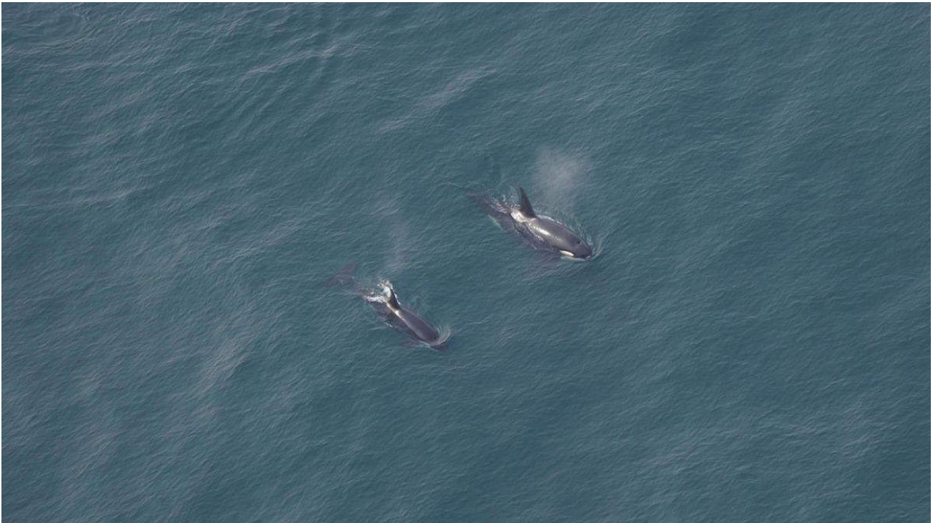
Two orcas swimming

A pod of four orcas were seen by an aerial team for the New England Aquarium, just 40 miles south of Nantucket. The killer whale population in North Atlantic waters is very small, so coming across the whales was particularly ‘special’ for the research team.