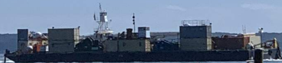
Barge, Vineyard Sound