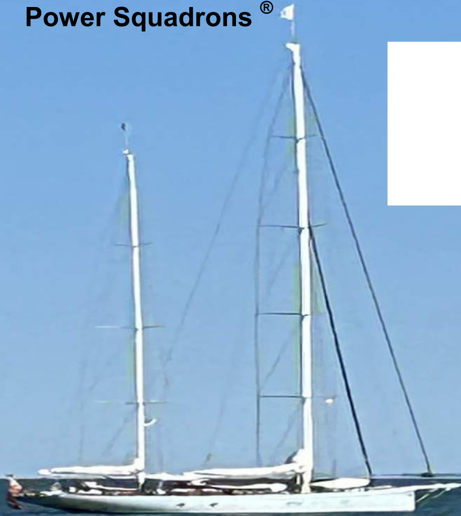
Superyacht Elfje (172')