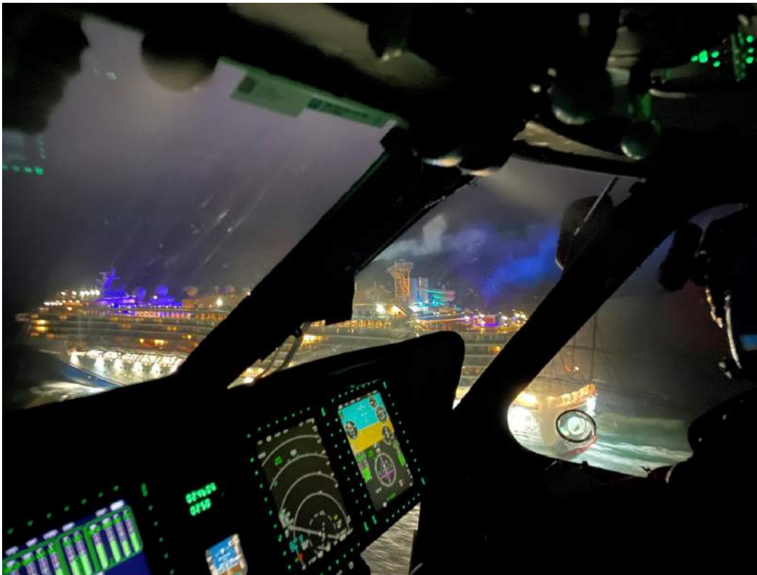
Coast Guard Air Station Cape Cod medevacs cruise ship passenger

A U.S. Coast Guard MH-60 Jayhawk flies over cruise ship to prepare for a medical evacuation, September 4, 2023 about 180 nautical miles from Cape Cod, Massachusetts. Air Station Cape Cod was launched after the cruise ship reported having a passenger on board experiencing abdominal pain.