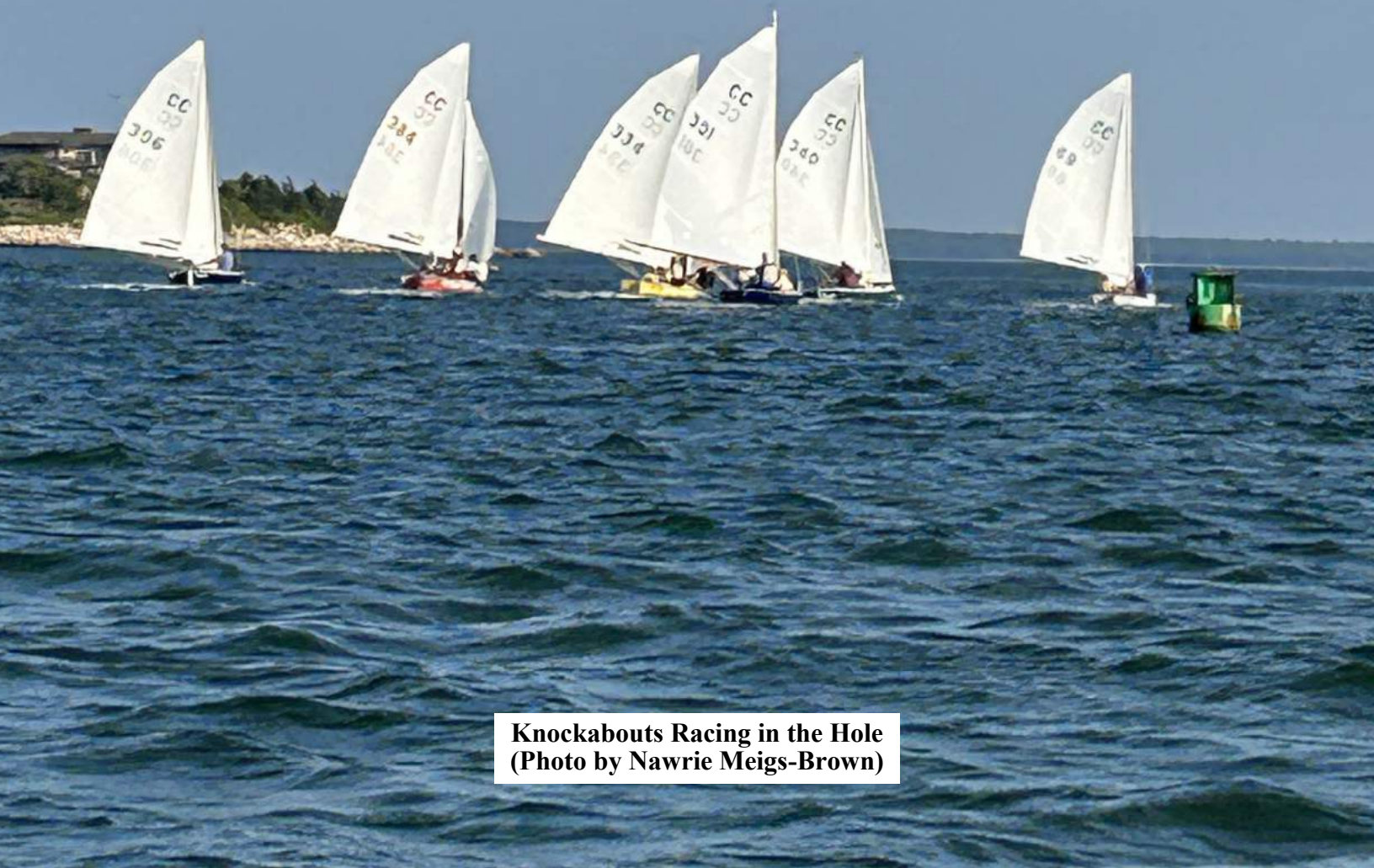
Knockabouts Racing in the Hole