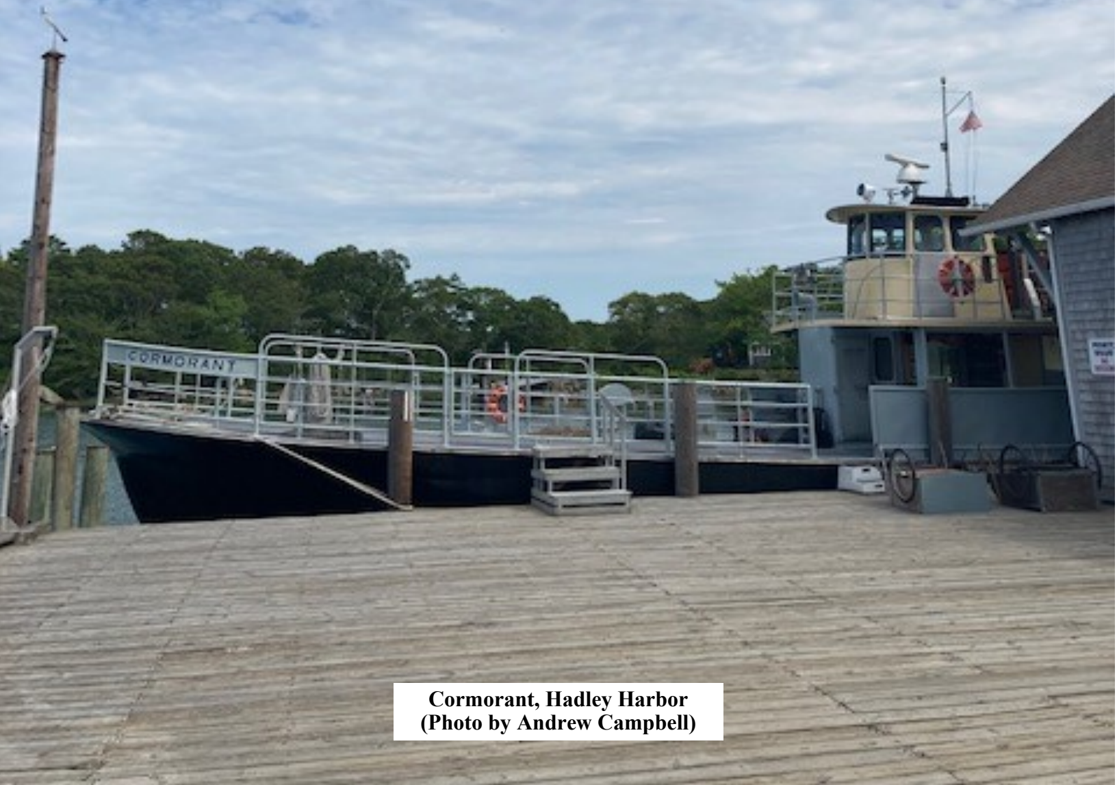
Cormorant, Hadley Harbor